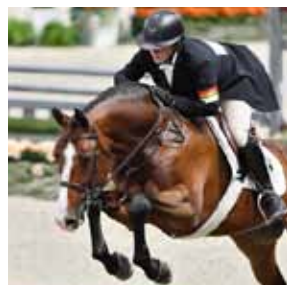
Capital Challenge September 30-October 6, 2024