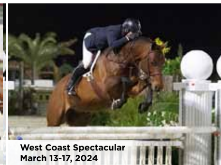
West Coast Spectacular March 13-17, 2024