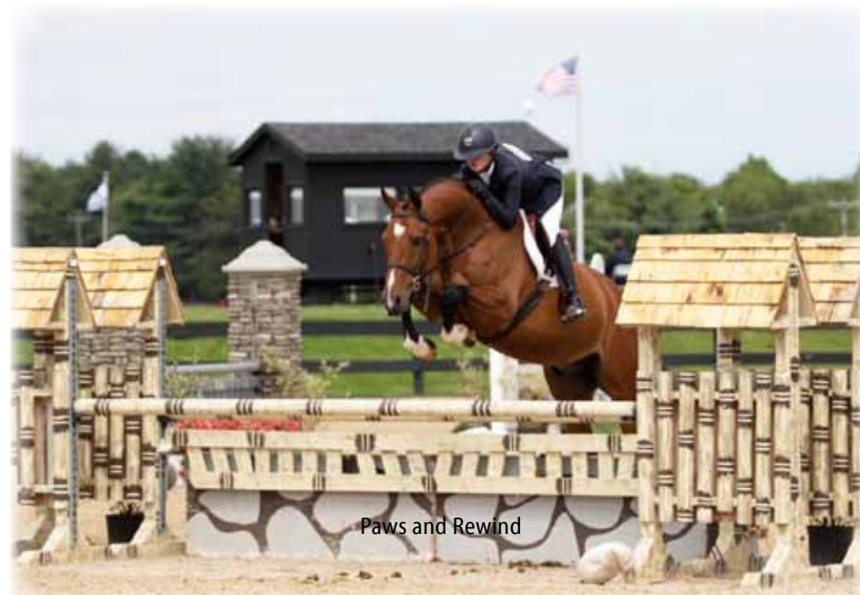
Paws and Rewind