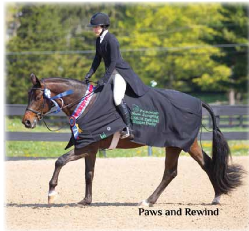
Paws and Rewind

The Princeton Equestrian League is dedicated to providing high quality competitions for Hunter, Jumper and Equitation riders. The league provides an opportunity for riders to compete throughout the year and qualify for the prestigious Princeton Equestrian League National Finals at Princeton Show Jumping in Skillman, NJ.